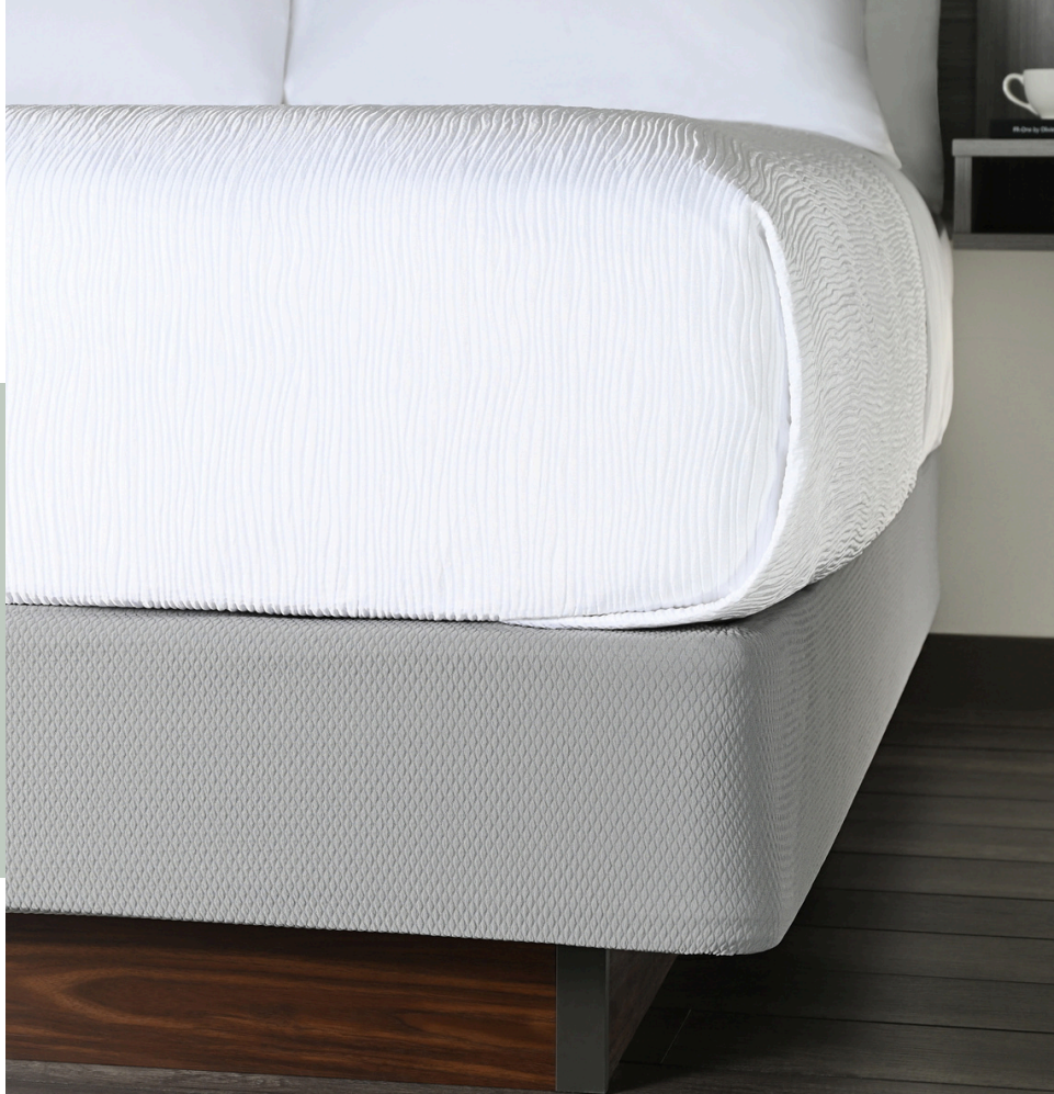
Indulgence QuickFit Box Spring Wrap in Light Grey

The Indulgence QuickFit Box Spring Wrap offers a sleek, tailored look with its textured diamond pattern. With a luxurious 300 GSM weight, it provides a high-quality feel, while elasticized corners ensure a secure fit. Designed for convenience, this wrap is easy to apply and remove without lifting the mattress, making it a practical and stylish addition to any bed.